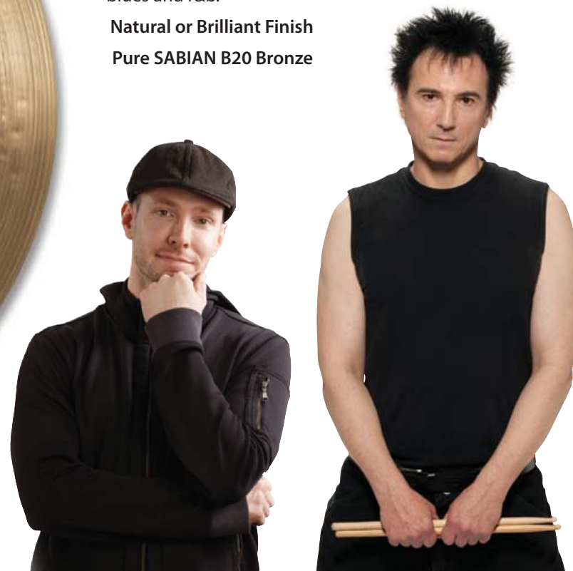
HH Leopard Ride HH Raw Bell Dry Ride

Natural or Brilliant Finish Pure SABIAN B20 Bronze