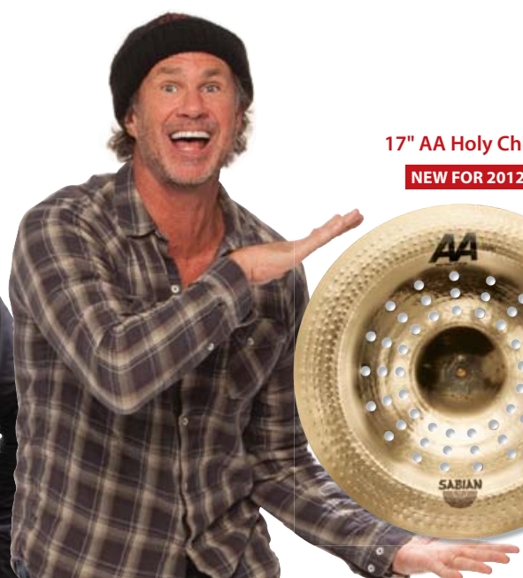
17" AA Holy China NEW FOR 2012