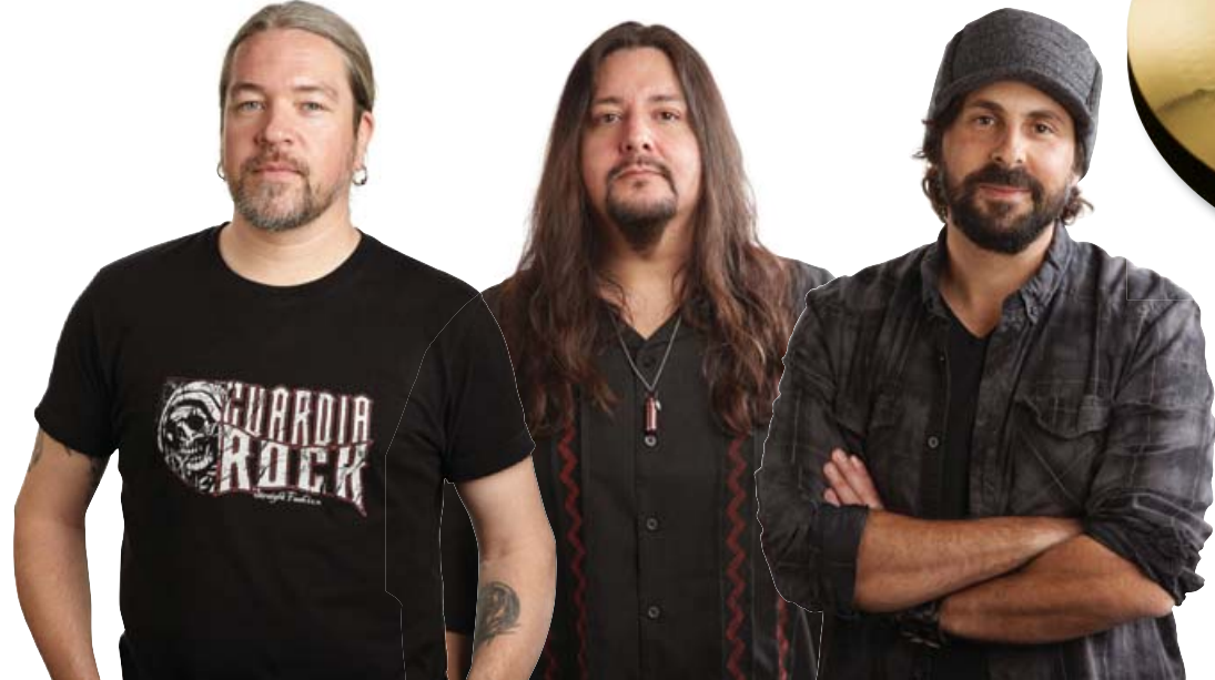
NEIL PEART Rush TOMAS HAAKE Meshuggah GENE HOGLAN Dethklok TONY PALERMO Papa Roach