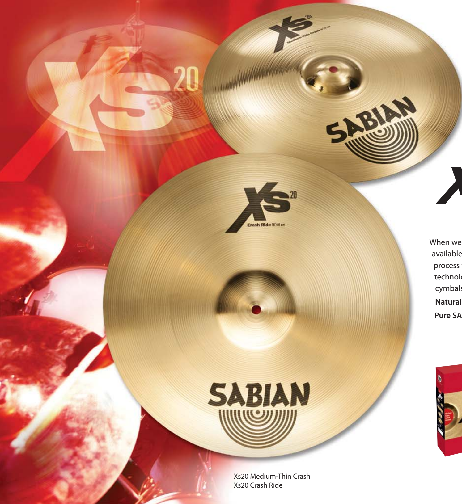
Xs20 Medium-Thin Crash Xs20 Crash Ride